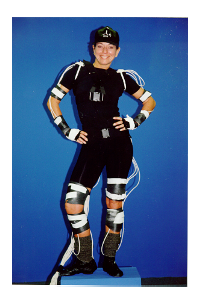
Figure 5: A performer wearing a motion capture apparatus. The device shown is a full body magnetic tracking system.