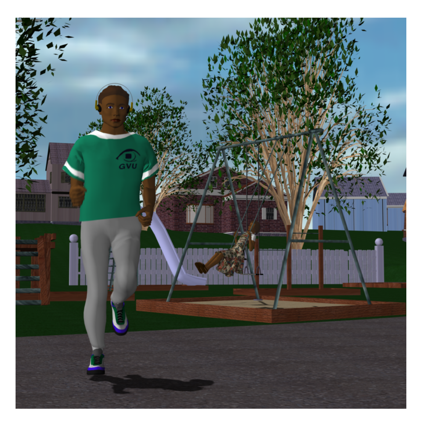
Figure 4: Runner in a park: All the objects in this image were animated using dynamic simulation. The runner and the child on the swing are active simulations governed by control systems. The clothing is a passive system that has been coupled to an active system.